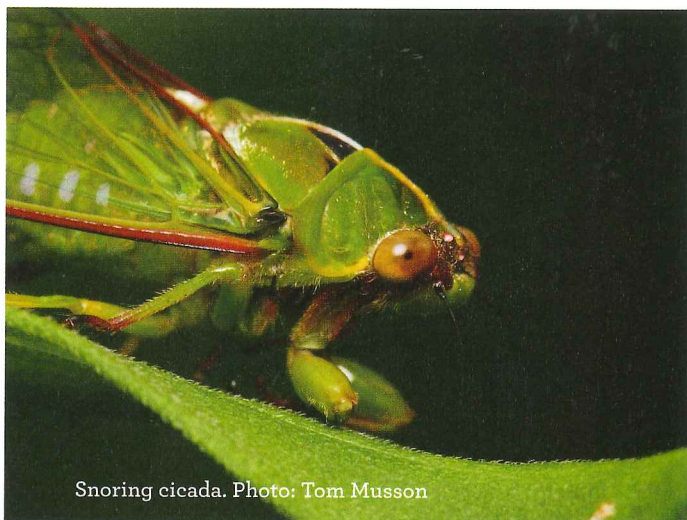
Snoring cicada.

"I know other kids aren't as interested in insects as I am, but this doesn't make me think that insects are any less cool. I really like the fact that only children can hear the high-pitched cicadas. I think this makes people who can find these cicadas special."