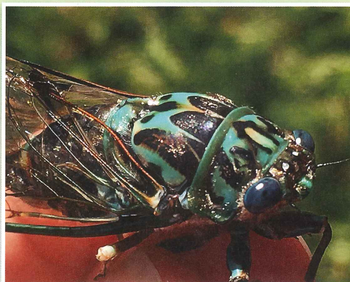
The blue chorus cicada ( Amphipsalta zelandica ) is also one of the largest NZ cicadas.

The coolest cicada I've found is the blue chorus cicada you can see in the photograph. I really like the fact that only children can hear the high-pitched cicadas – I think this makes people who can find these cicadas special.